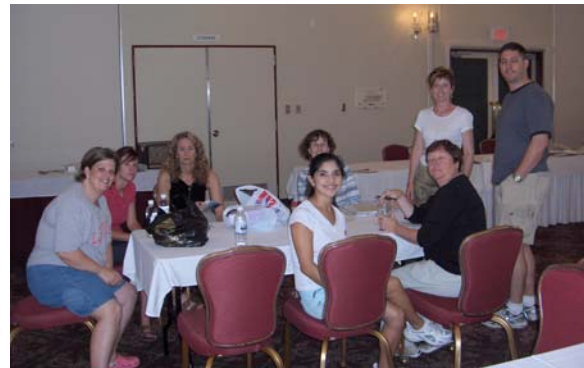
The Work Party

Look for details on our successful auction next month!