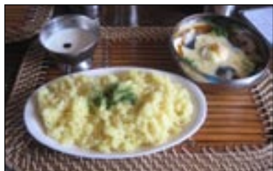
This is a full-sized portion of mixed veggie curry with rice.

That said, none of the curries we tried were at all spicy, but there was a "spice" shaker at the table which could be used to heat up your dish. Though I usually enjoy my curry on the hot side, I was so pleased with the flavor of the curry that I forgot about spicing it up. It was mild, but by no means was