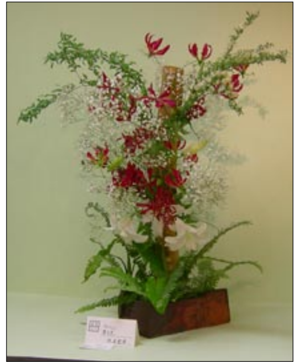
some of the arrangements